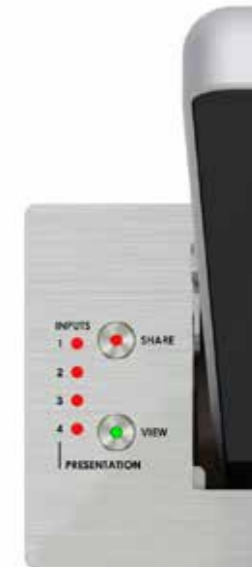
For Delegate units