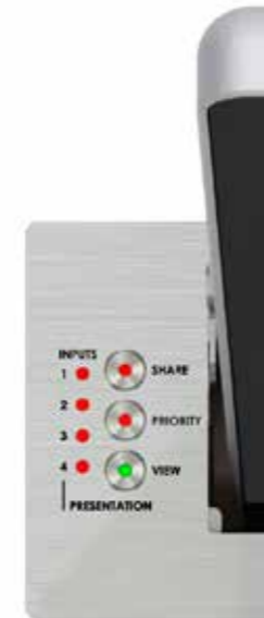
For Priority units